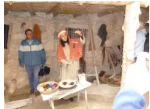
Woman spinning thread.

Day 4 We tour completely around the Sea of Galilee visiting Capernaum where Jesus attended Synagogue, see the possible remains of Peter's house, visit the Mount of the Beatitudes, and ride on a boat for about 10 minutes. We also visit the Mount of the Beatitudes where Jesus preached His most famous sermon. We end the day with a visit to Korazim where the remains of a first century synagogue still exist where Jesus may have attended.