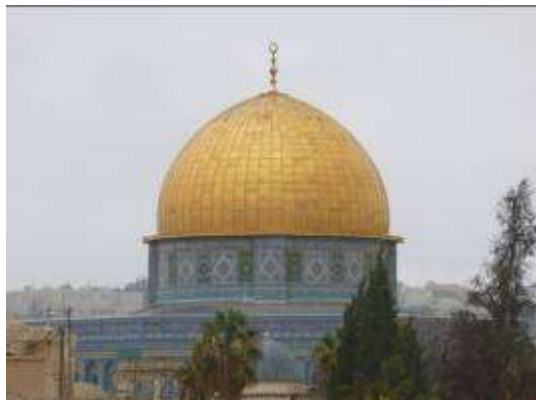
Dome of the Rock, Jerusalem

Day 6 Today we are in Jerusalem. We visit the chamber of the Holocaust in memory of the 6 million Jews who perished in WWII. We enter the Jewish Quarter to visit the Temple Institute which is looking for funding to rebuild the Third Temple. Under King David and then Solomon the first temple was built. We visit the Temple in the Israel Museum to see a model of the second temple that Jesus saw in His day. The Shrine of the Book is interesting, we watch a movie inside the structure showing